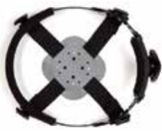
HPR441 – 4-point Ratchet Replacement Suspension