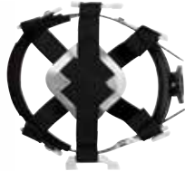
HPR461 – 6-point Ratchet Replacement Suspension