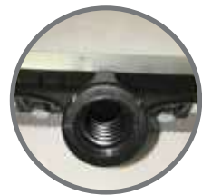
Heavy-Duty Polymer Threaded Handle Adapter