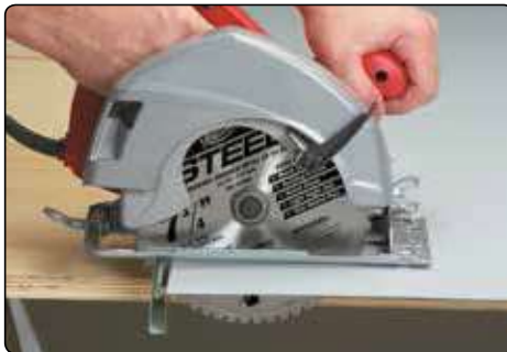
Standing Seam Metal Roofing

Cool Clean Cuts in metal roofing & metal building panels