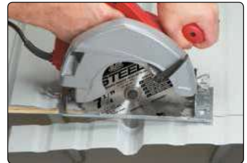
Metal Building Panels

Specially formulated, tough c-6 carbide tipped blade fits all popular brands of portable circular saws. Lasts up to 30 times longer than abrasive disks for cutting unhardened ferrous metal. Makes true, flat cuts in standing seam metal roofing and metal building panels without burning paint or protective coatings. Also makes clean cuts in metal studs, light angle iron and thin walled pipe.