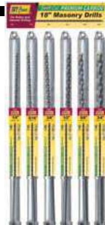
Size: 12"W, 25"H