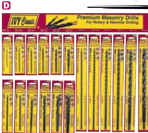
Size: 25"W, 24 1/2"H