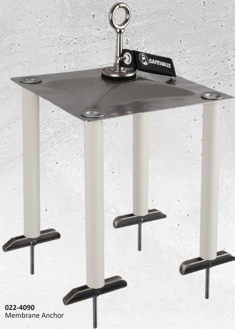
022-4090 Membrane Anchor