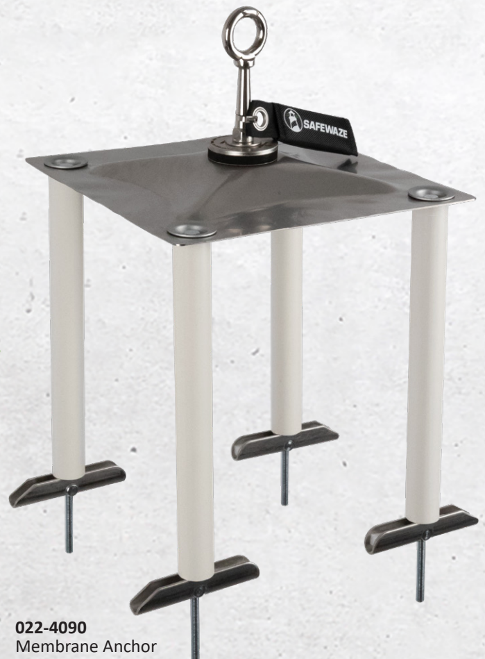
022-4090 Membrane Anchor

With a 360° working radius and an elevated eye bolt to prevent wear and tear on the roof, the innovative Membrane Anchor is easily installed as a permanent anchor point.