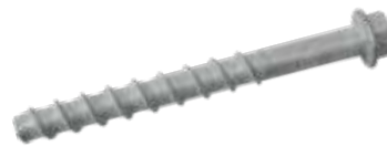
021-4053 Replacement Concrete Bolt (for use with 021-4052)