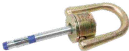
021-4054 5K Swivel Anchor & Concrete Wedge Bolt