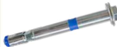
021-4073 10K Replacement Concrete Wedge Bolt (for use with 021-4072)