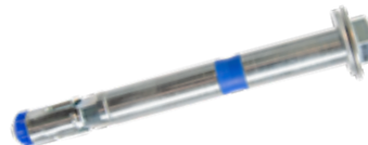
021-4057 5K Replacement Concrete Wedge Bolt (for use with 021-4054)