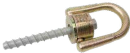
021-4052 5K Swivel Anchor & Concrete Bolt